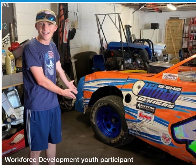
Workforce Development youth participant