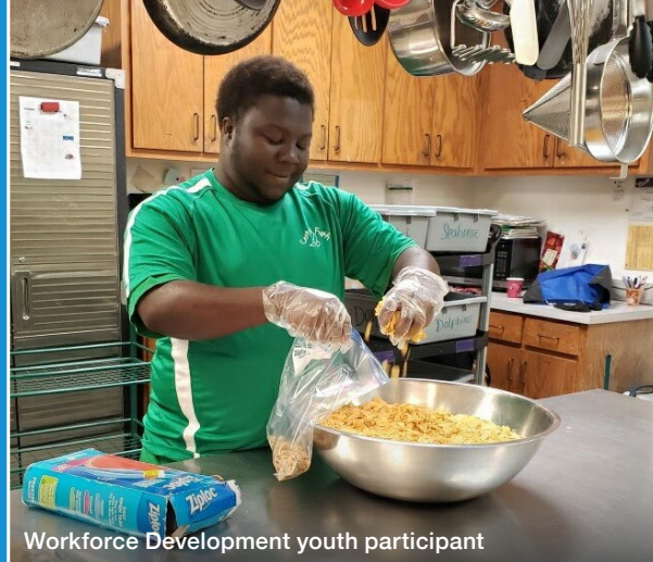
Workforce Development youth participant