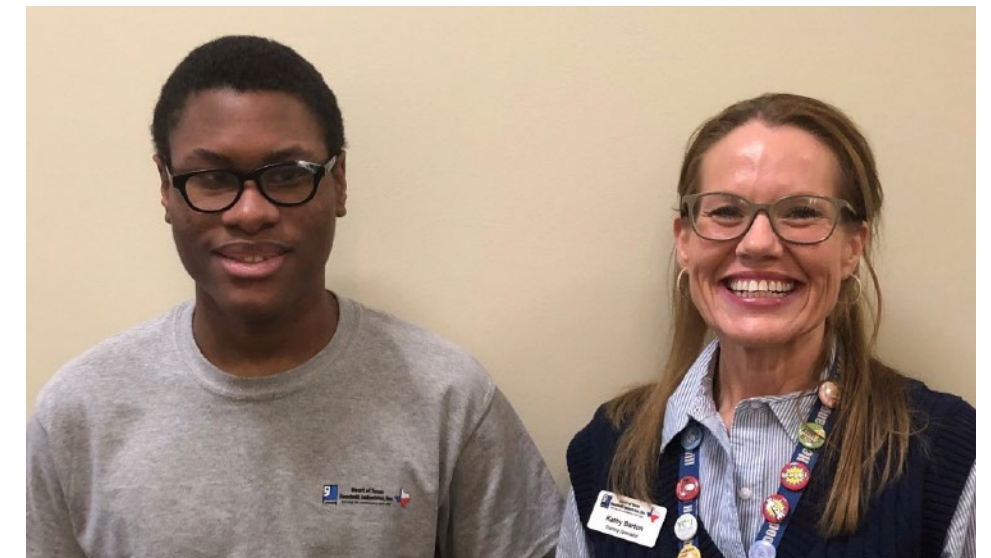
Workforce Development youth participants